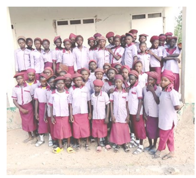
A Prayer for the Students in Nigeria:

Gracious God, thank you for the gift of knowledge! We praise you that you provide us with brains to think and question the world around us. We pray you would help these students learn well and flourish. May they discover their unique talents and giftings. Give them a passion for the world around them. Watch over them in every area of their life and keep them safe. Amen.